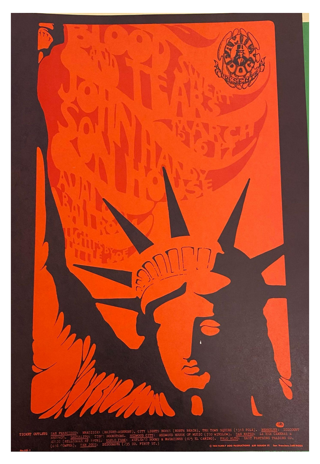
Figure 3, Stanley Mouse, Blood, Sweat, and Tears , 1968