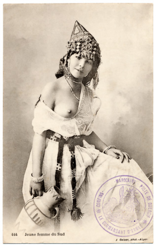
Fig. 4. Jean Geiser, Jeune femme du Sud, late eighteenth or early nineteenth century, photograph.