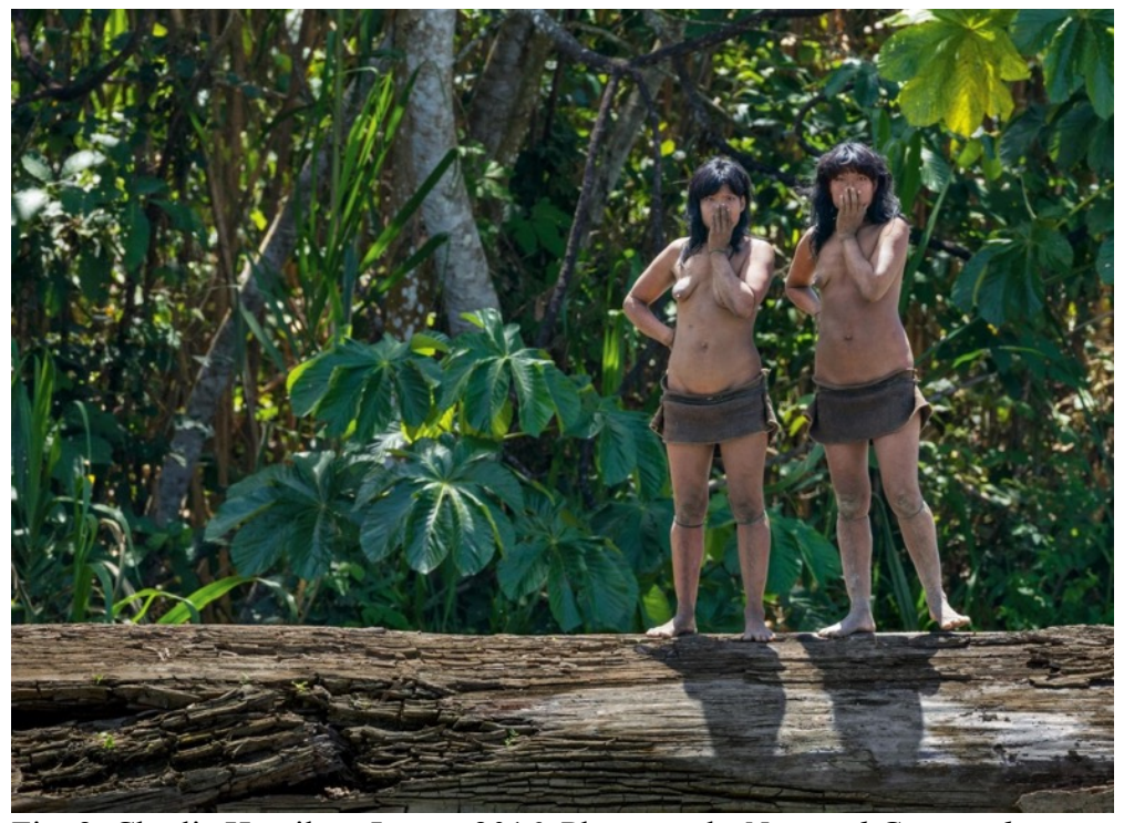
Fig. 2. Charlie Hamilton James, 2016, Photograph, National Geographic . <a href="http://www.nationalgeographic.com/magazine/2016/06/manu-peru-biodiversity-national-parks/">http://www.nationalgeographic.com/magazine/2016/06/manu-peru-biodiversity-national-parks/</a>