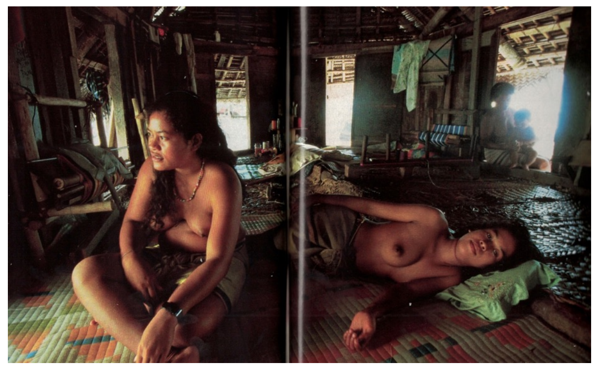
Fig. 8. David Hiser. 1986, Photograph, National Geographic (170), no.4.