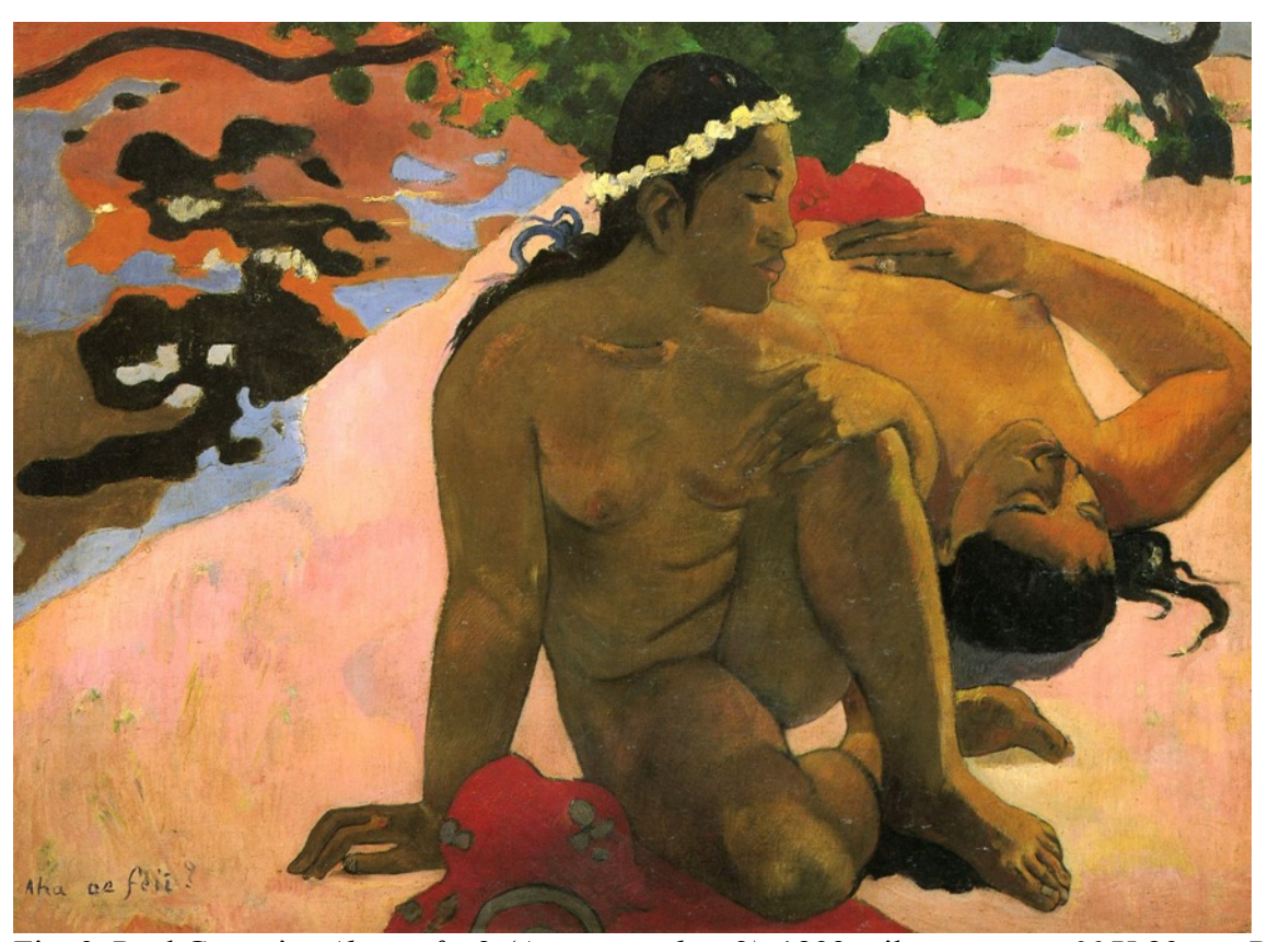
Fig. 9. Paul Gauguin, Aha oe feii? (Are you jealous?) , 1892, oil on canvas, 66 X 89 cm, Pushkin State Museum of Fine Arts, Moscow.