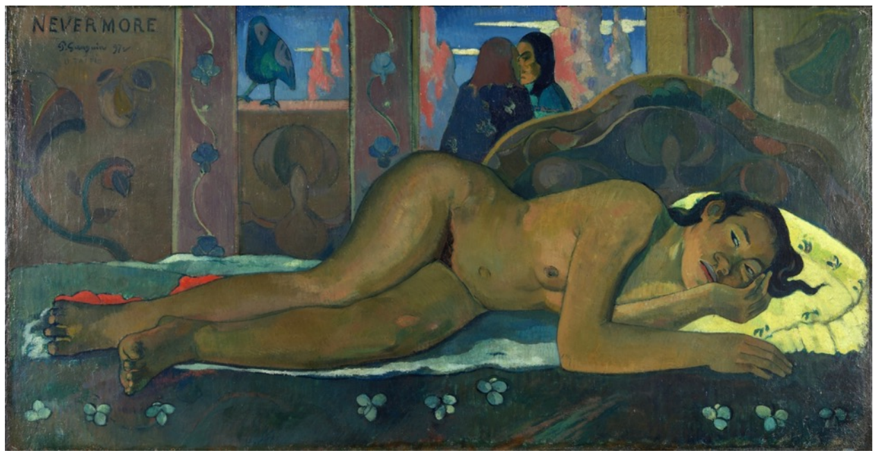
Fig. 10. Paul Gauguin, Nevermore , 1897, 20 X 46 cm, The Samuel Courtauld Trust, The Courtauld Gallery, London.