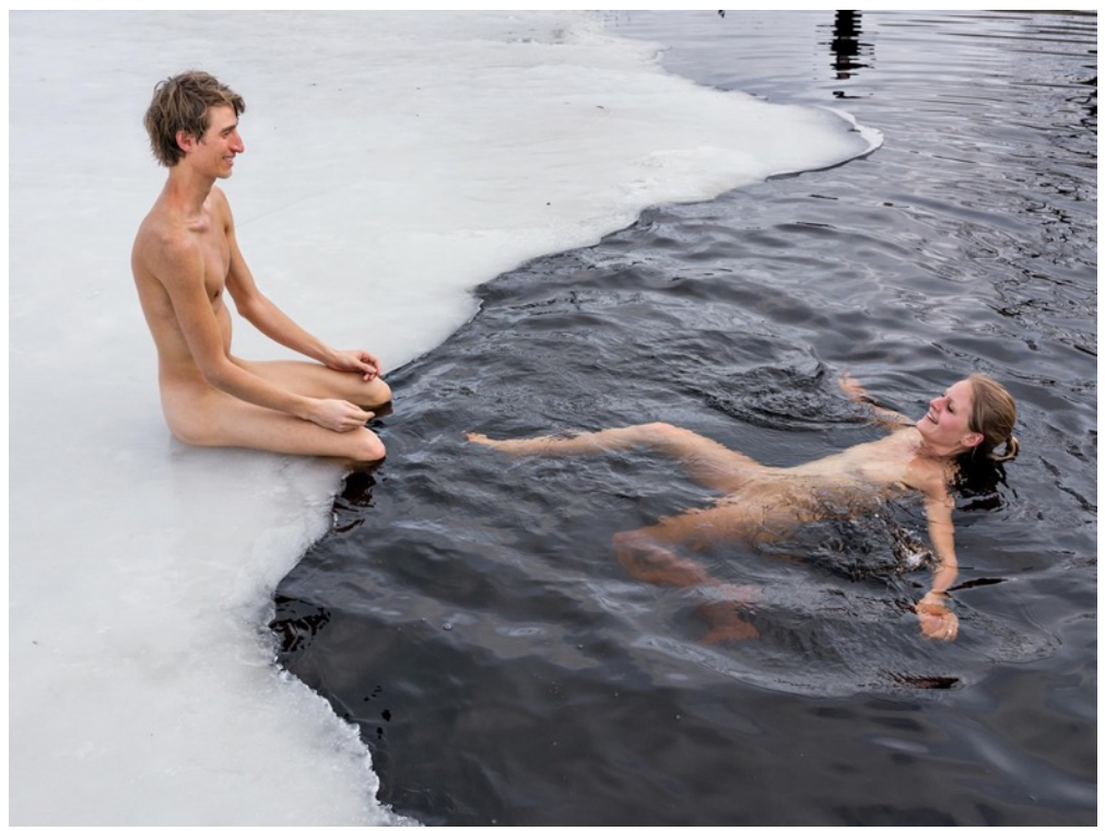
Fig. 1. Lucas Foglia, 2016, Photograph, National Geographic . http://ngm.nationalgeographic.com/2016/01/call-to-wild-text