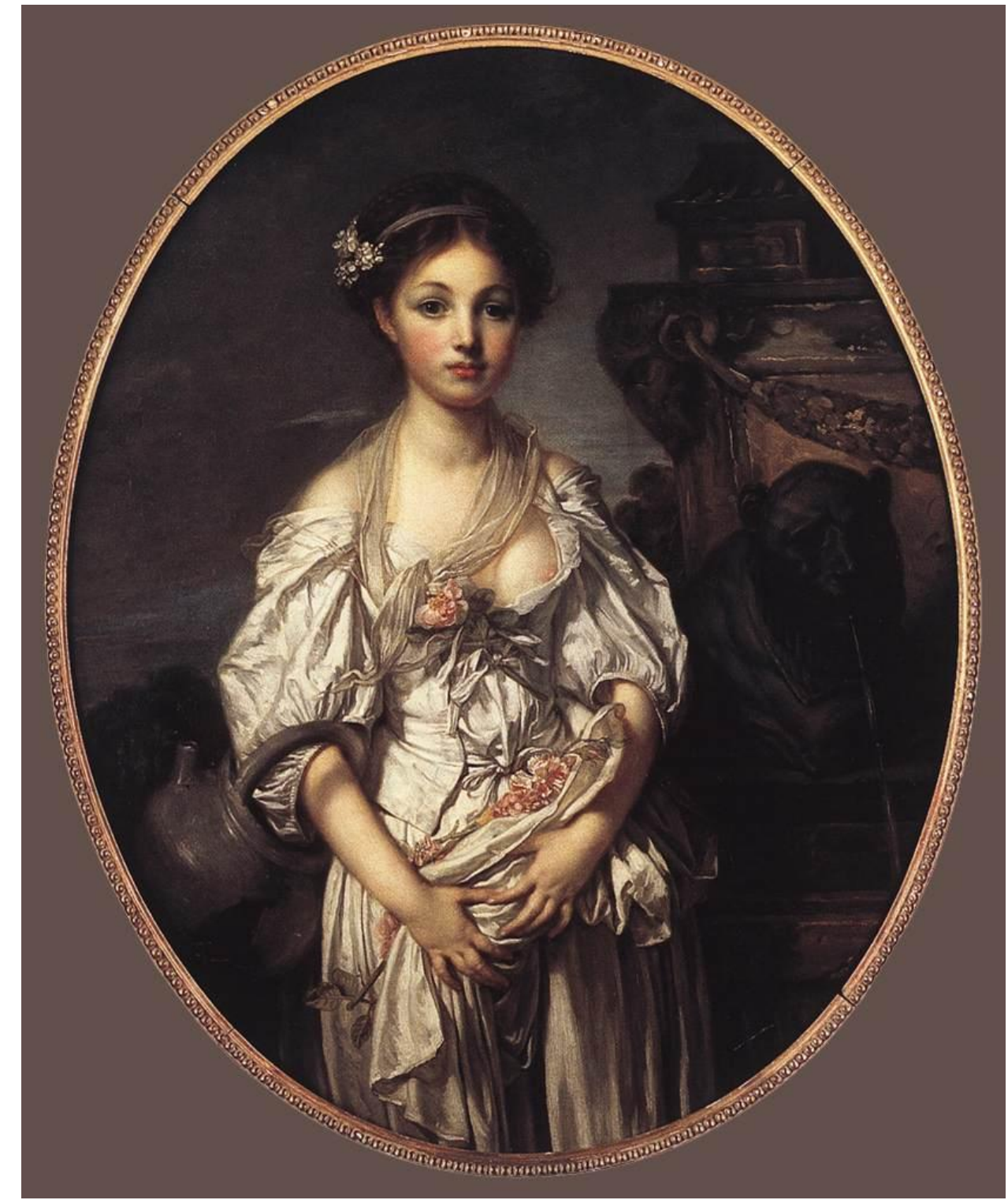
Fig. 5. Jean-Baptiste Greuze, The Broken Pitcher , 1771, oil on canvas, 109 X 87 cm, Musée du Louvre, Paris.