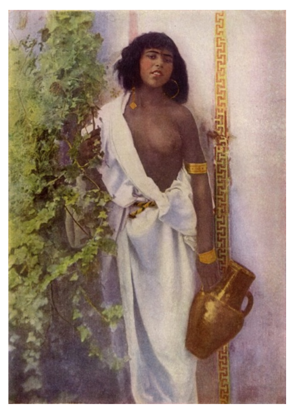
Fig. 3. A Bedouin Beauty, March 1917, photograph, National Geographic.